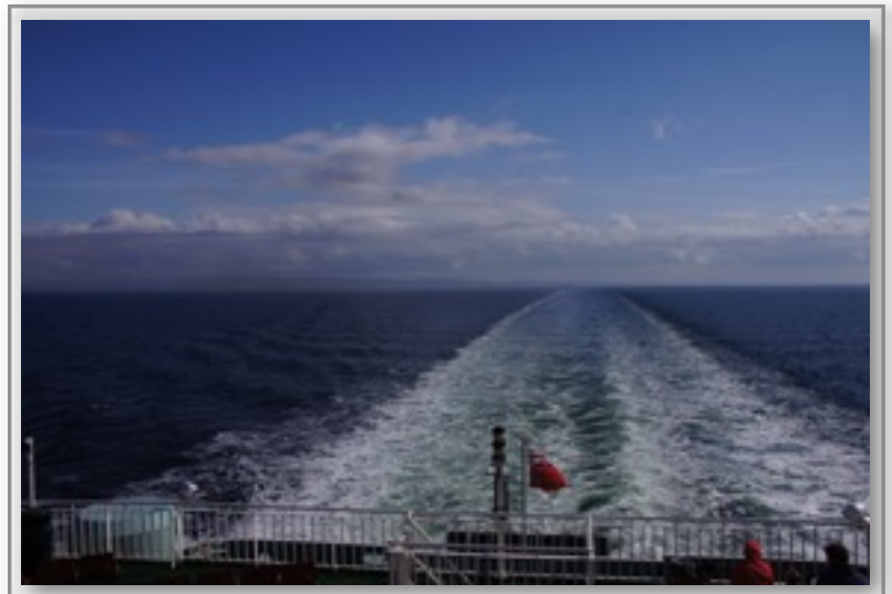
Leaving the mainland behind!